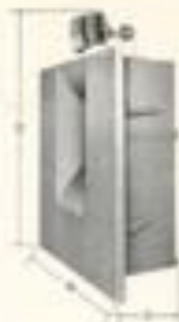
Illustration of a low frequency horn from the T-500 series.

The low frequency horns of the T-500 of the T-500 series are the most sophisticated low frequency sound reproduction. Based on years of sound reproduction and scientific research, they have been designed and perfected by the nation's top flight sound engineers. They are unique in design, rigid in construction and perfect in performance. A strongly built, weather resistant aluminum back stage construction and housing... a dual angle or reflector horn pattern... multiple vent ports for all weather sound energy... rigid construction provides maximum sound quality. These are a few more of the many features of the T-500 series horns from the T-500.